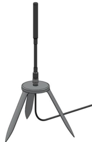
Optional ground mount